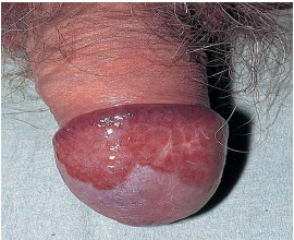
A most shiny, acrohemorrhagic, well-demarcated plaque on the glans penis in an older uncircumcised male is characteristic of Zoon's leukoplakia, also known as balanitis plasmacellularis. The condition is benign.